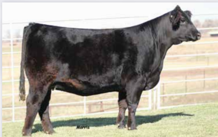
MAGS BARONESS | Dam of Lot 94