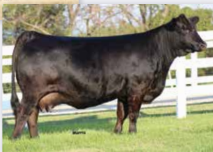
SBLX ZERO OUT Dam of Lot 89 embryos