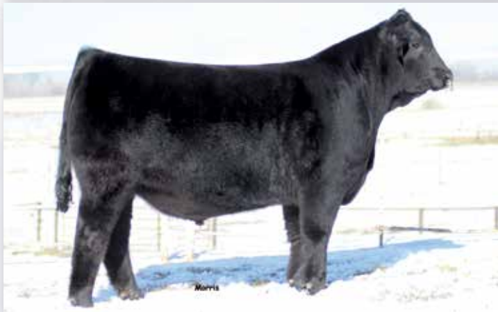
MAGS AVIATOR | Service sire to Lot 1

It's hard to know where to start when describing this phenomenal black, polled 68% Lim-Flex spring bred female. From a pedigree standpoint she boasts sires and dams of distinction up and down both sides of her pedigree, beginning with her sire, the wildly popular AI sire of both performance and phenotype, MAGS Ali. On the bottom side is none other than one of the greatest purebred donors to exist, MAGS Manuela. Her influence and revenue generating power is among the all-time greats in the breed. Phenotypically, this female is solid from the ground up while displaying ample muscle, a level top and a sweeping ribcage. On paper, she projects to add breed-leading genetics for weaning weight, yearling weight, scrotal circumference and carcass weight. The icing on the cake is her service to MAGS Aviator, one of the most popular Lim-Flex AI sires in the breed today. All the parts and pieces are in place, giving every indication that AUTO Ebony 202E is destined to become a dominant force in the pages of Limousin history.