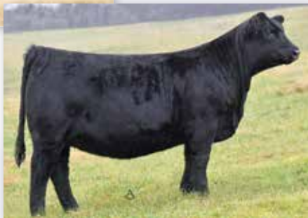
TMCK FOXTROT 569F ET Dam of Lot 88 embryos