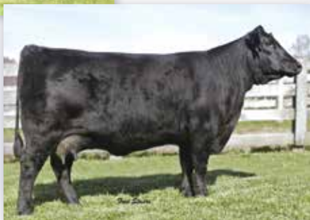
LH RADIANT Maternal grandam of Lot 90