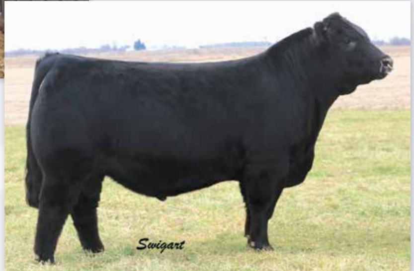
RLBH AIR FORCE ONE | Lot 87