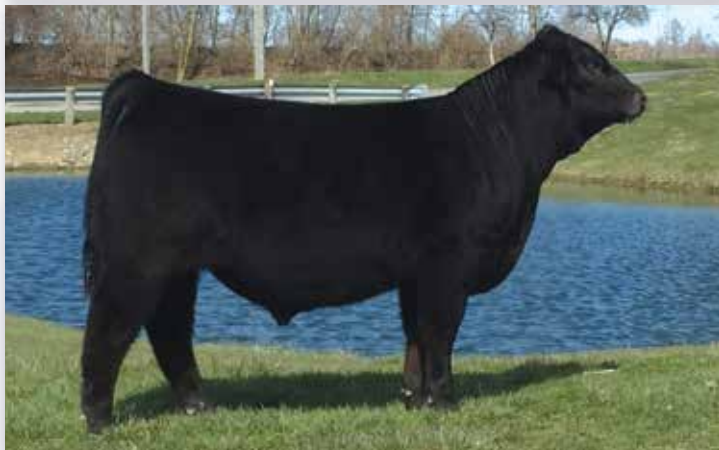
FWLY PURPLE HAZE 742E | Service sire to Lots 15, 17, 22 & 70