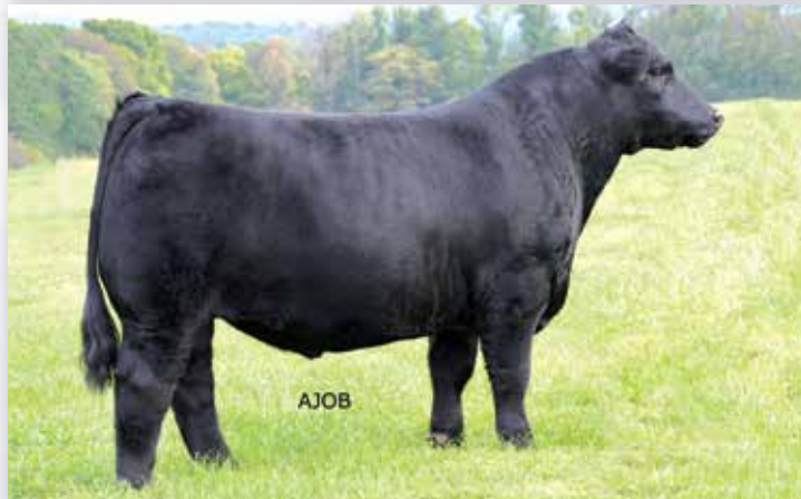
TMCK ARCHITECT 031A | Sire to Lot 94