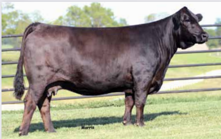
MAGS MANUELA | Dam of Lot 1