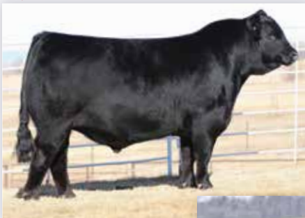
MAGS CABLE Sire of Lot 88 embryos