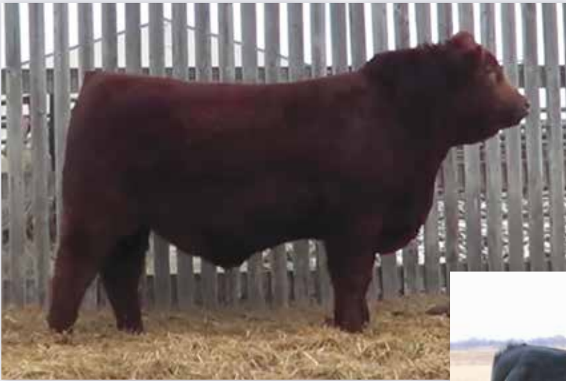
JYF EDMONTON 519E | Lot 86