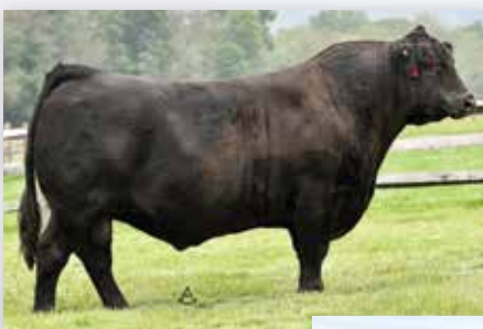
CJSL CREED Sire of Lot 90