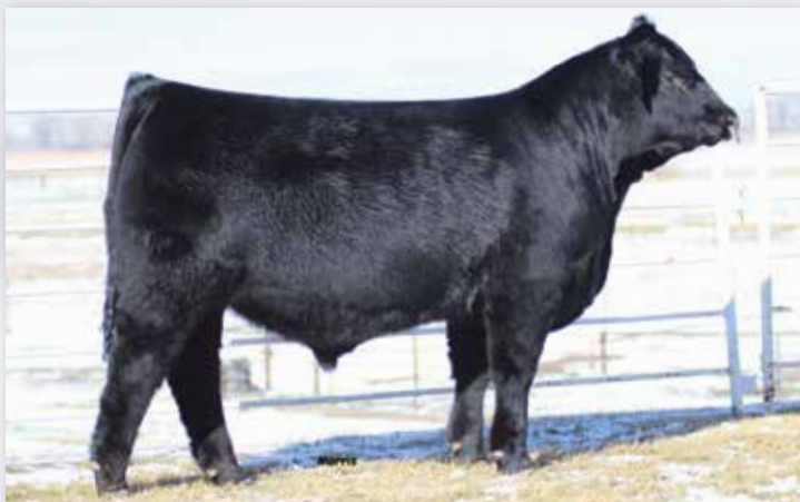
MAGS ANTELOPE | Sire of Lot 70