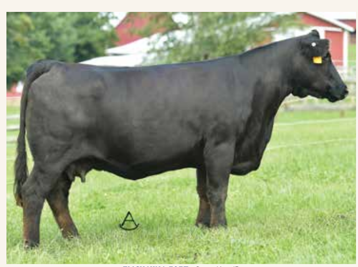
TMCK NINA 505Z • Dam of Lot 45

Arnett Styling Harlow is a moderate framed 62% Lim-Flex daughter of the past Denver National Champion Bull, HUBB Bulletproof. Her dam comes from MAGS Y So Tangled. Moderate birth weight with growth and carcass round out this package. She sells bred to ELCX Greek 308G.