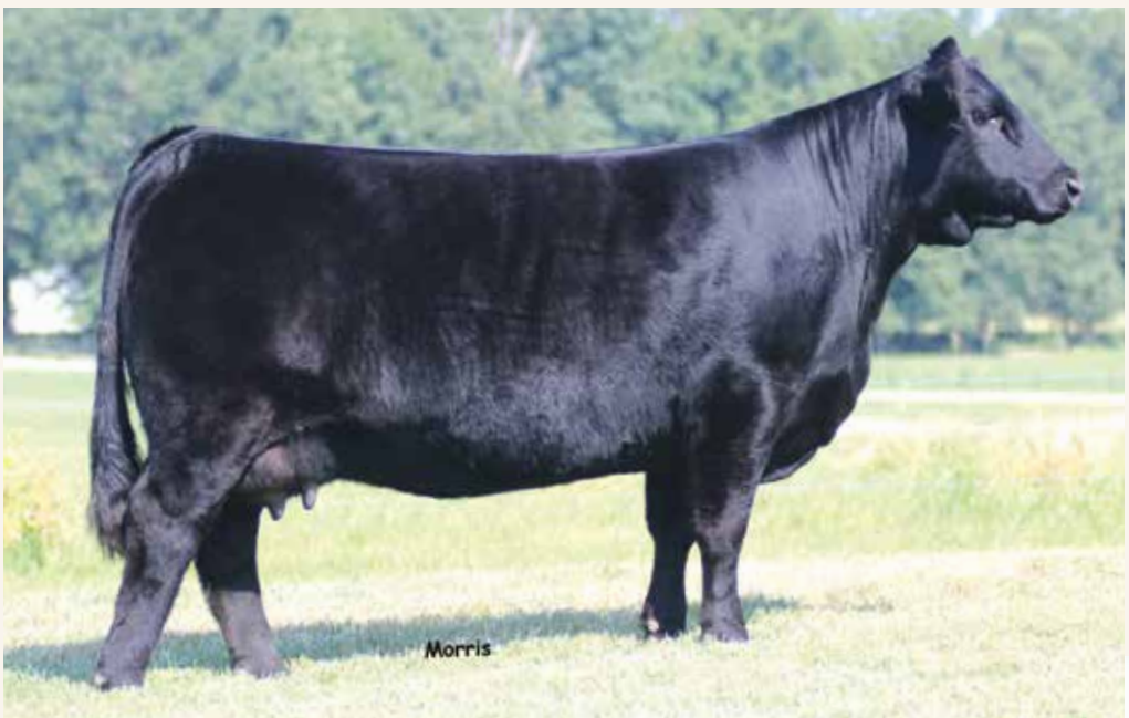
AUTO LUCKIE 246W • Dam of Lot 7