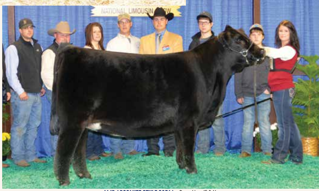
LLJB ABSOLUTE STYLE 3056A • Dam of Lots 15 & 16