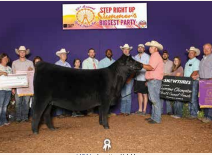
LOT 3A • Dam of Lotc 3B & 3C