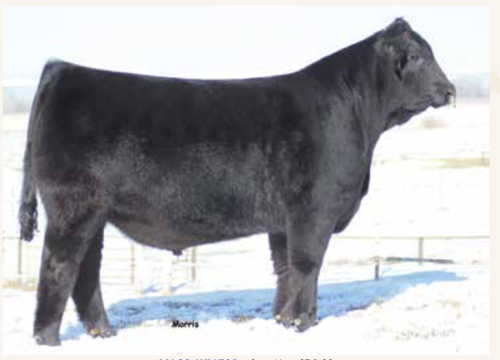
MAGS AVIATOR • Sire of Lots 37 & 38

Looking for a different pedigree twist to bring into your herd? Then Miss L7 752E will fill that order. She will provide lots of options for breeding. She's a 37% Lim-Flex who is capacious in her rib design, fluid in her movement and sound in her numbers. Check out her February heifer by MAGS Grizzly Rose at side.