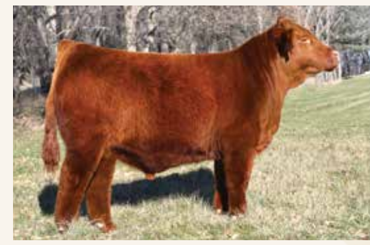
ROYAL JESTER RBGL 103J • Maternal sib in blood to 4B