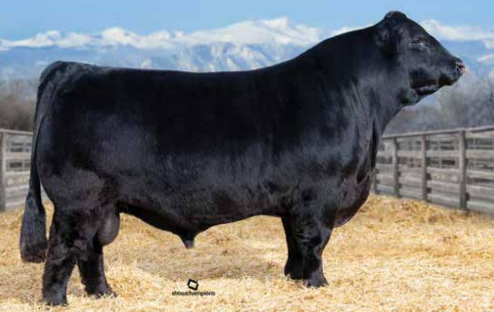
ELCX KINGS LANDING 599 D ET • Sire of Lot 64