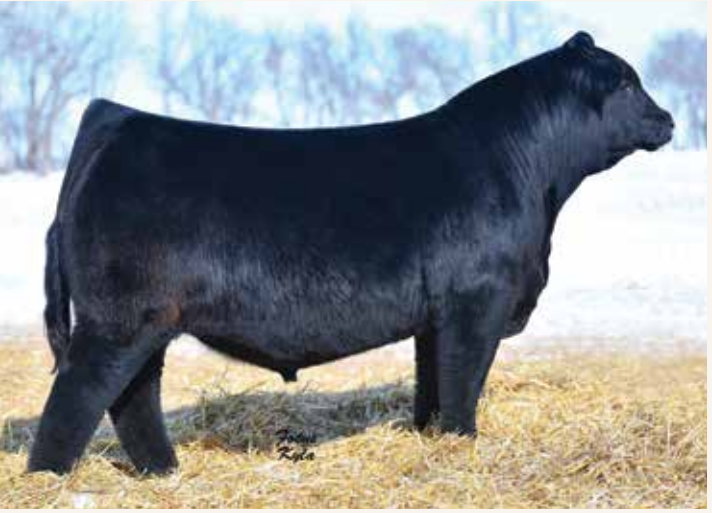
ROMN FLOYD MUDHENKEY 101F • Sire of Lot 60