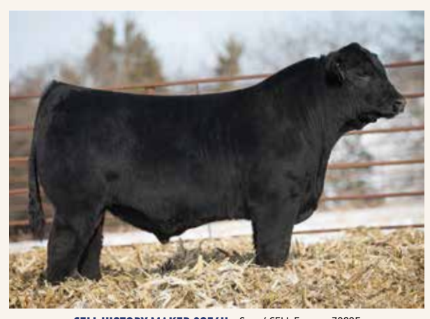
CELL HISTORY MAKER 0256H • Son of CELL Envision 7023E

This is a HUGE opportunity! This pregnancy is a full sibling in blood to one of the hottest bull's in the breed-CELL Envision. Here's your chance to capitalize on a tried-and-true mating. With double-digit calving-ease direct and top ranking weaning and yearling weight EPDs, balanced with plenty of milk and loads of ribeye and marbling, you've got a calf that will be a game changer. Not to mention, the calf will be homozygous polled. The sire of this mating has 181 progeny recorded at NALF, which only enhances the value of this September calf. The Envision cattle, be it herd bulls or potential donor females, have been some of the most sought after genetics in the breed the last several years. When it comes to proven, profitable genetics, it simply doesn't get any better.