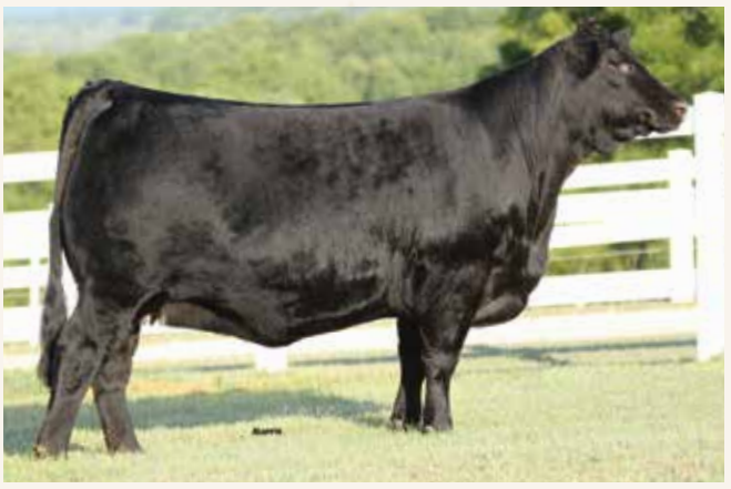
MINO FIONA ET • Dam of Lot 65