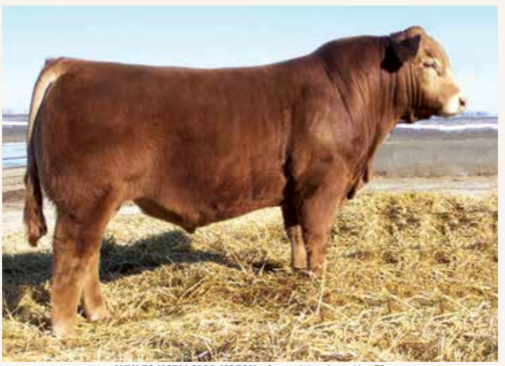
WULFS XCELLSIOR X252X • Paternal grandsire of Lot 75

There's always one that is cataloged last, but that doesn't take away from this bull. This young red, purebred is homozygous for the polled trait. His pedigree is strong in growth genetics. He should be a calving-ease sire with his double-digit CED and 0.0 BW EPDs. Take note of his 1.31 ribeye EPD, that's an elite carcass trait! He has a lot of look with natural thickness and style.