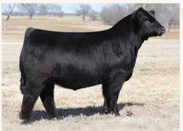
ATNF HIGHER REVENUE JCLCO13H • Sire of Lot 3C embryos

LYDH Judgement Day is a purebred bull who is double homozygous. He is the result of mating championship genetics on both sides of is pedigree. Study his picture, he exemplifies the Limousin bull business with his ruggedness and soundness. He's big boned, loaded with depth of rib and has an excellent rear quarter. Take note of his adjusted yearling weight of 1,332 which translates to added pounds in your next calf crop. You be the judge May 7!