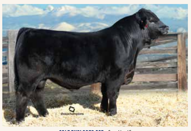
COLE EXPLORER 22E • Sire of Lot 65

Looking for a powerhouse of a high percentage Lim-Flex bull? You'll definitely want to study MINO Hudson 027H who is double homozygous and chock-full of natural thickness. This son of COLE Explorer offers breed-leading weaning and yearling weight EPDs, ranking in the top 1% and 3%, respectively. His dam, MINO Fiona, is sired by CJSL Creed and produced by AUTO Callie, a past All-American Futurity Reserve Supreme Champion for Ellie Dill. MINO Fiona continued that cowy look as you can see from her picture. We feel Hudson is the perfect blending of two breed greats! This bull is ready to get out and go to work!