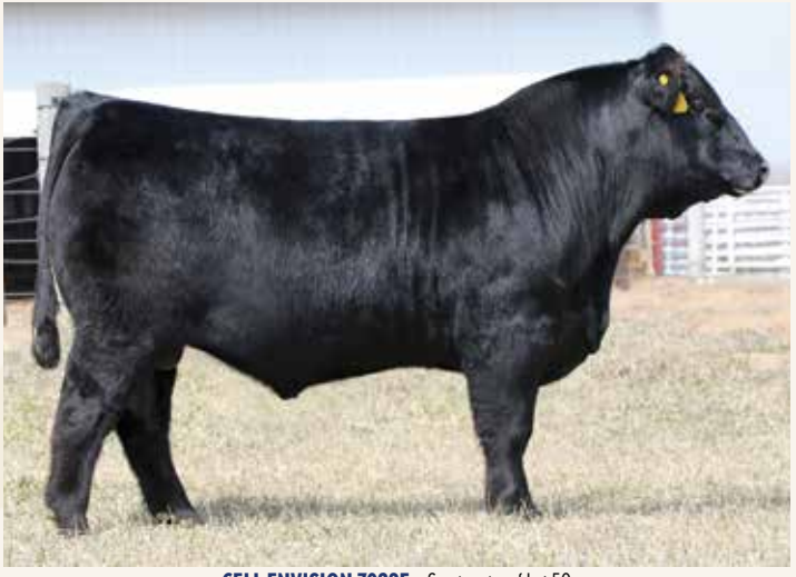
CELL ENVISION 7023E • Service sire of Lot 50