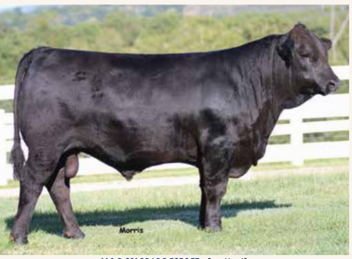
M & R COLORADO 525C ET • Sire of Lot 49

This young homo polled, homo black cow is out of an EXAR Denver son, MIDL Colorado 525C and a cow whose dam is out of the renowned EXLR Luvly O81F. She has a nice homo black, homo polled bull calf at side by the huge-numbered, calving-ease sire for Middleton Limousin, MIDL Genesis 159G. Genesis ranks in the Top 15% CED, 2% BW, 2% YW, 4% Milk, 1% TM and 15% MTI. She sells 4 months safe to MIDL Hector Lives, our huge-numbered bull out of TNGC Empire x LFL Zamora