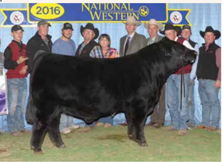
HUBB BULLETPROOF • Sire of Lot 44