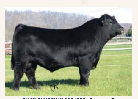
TMCK CAMDEN YARDS 195C • Sire of Lot 43