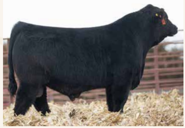
CELL HISTORY BUFF 0245H • Son of CELL Envision 7023E