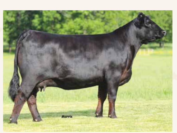
AUTO MABELLINE 267Z • Dam of Lot 6