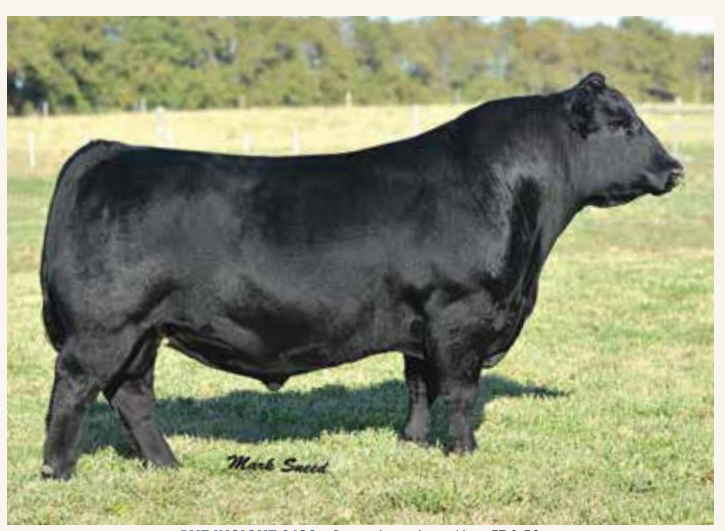
PVF INSIGHT 0129 • Paternal grandsire of Lots 57 & 58

THIL Josie 30J is a paternal sister to Lot 57. She offers lots of rib shape and overall thickness in an eye-appealing package. The dam side of her pedigree is equally impressive. Check her out May 7. Sells open.