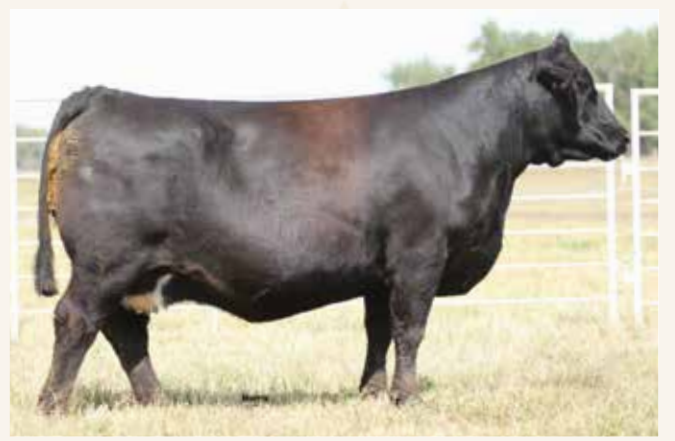
MAGS CONSTANCE ET • Dam of Lot 5