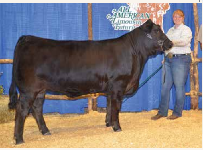
AUTO MISTY 291Z • Maternal grandam of Lot 57

Looking for a nice replacement female with a balanced set of numbers? Here's THIL Jacey. This homozygous black, 50% Lim-Flex totes a powerful pedigree of legendary leaders in both the Limousin and Angus breeds. You won't go wrong with this female. Sells open.