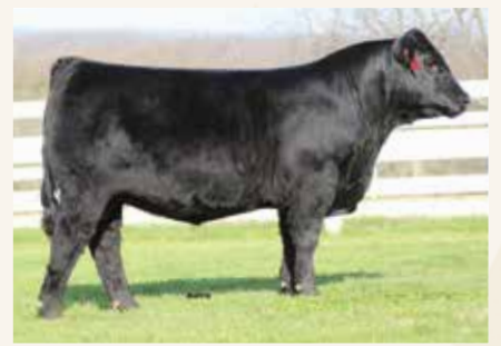
AHCC EASY RIDER 5594E • Sire of Lot 42