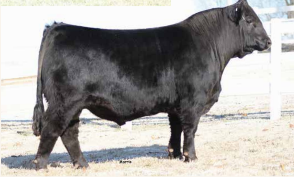
TNGC EMPIRE 736E • Sire of Lot 8A