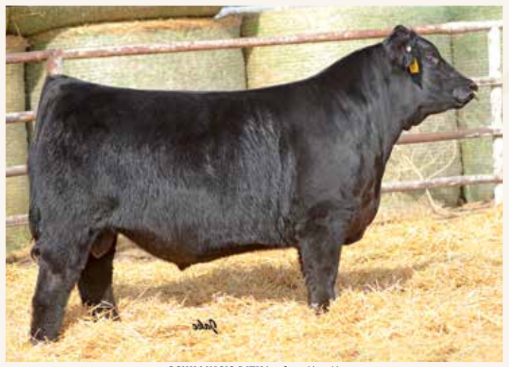
SCHILLING'S DITKA • Sire of Lot 46

Here's a broody female who is sound in her structure and solid from the ground up. Her sire is a product of AUTO Cruze x KRVN Spritzer. The dam's side is equally impressive tracing back to the DVFC Nina cow family. This double homozygous purebred is carrying the service of ELCX Greek 308G.