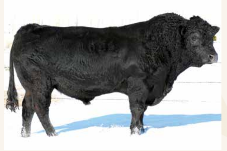
RUNL STETSON 850S • Paternal grandsire of Lot 74

Arnett Styling Juice is a yearling purebred bull who records a big weaning weight EPD with the bonus of solid carcass values. This son of Wulfs Felan out of a big-bodied female, GV Ms Atlantis 5519C, has lots of thickness and the look to sire a great set of calves.