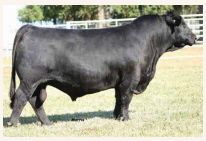
PBRS BUNK HOUSE 48B • Sire of Lot 5