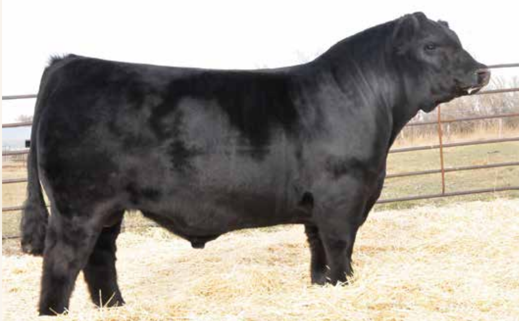
L7 CALVADOS 5035C • Sire of Lots 15 & 16