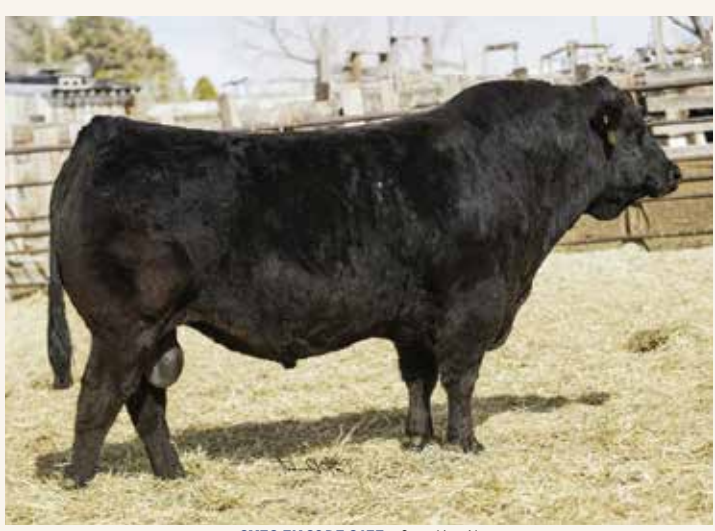
SYES ENCORE 315E • Sire of Lot 61

Arnette Styling Jolene is a homozygous polled 69% Lim-Flex from the popular ROMN Floyd Mudhenkey who has done a great job siring cool-looking females. Her dam, MAGS Dialing Home, sells as Lot 39. This May heifer has the look for the show road, and the genetics for the pasture. Sells open.