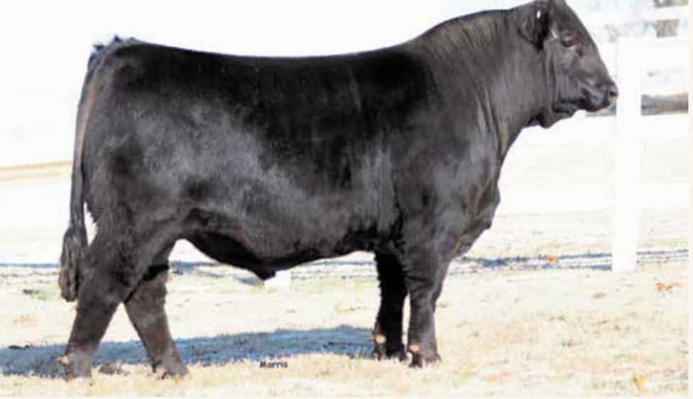
TNGC EMPIRE • Service sire of Lot 43

LIM-FLEX(59/52.9) COW • DOUBLE BLACK • HOMO POLLED (P-2) 9/14/2020 • MMJH 002H • LFF2290286