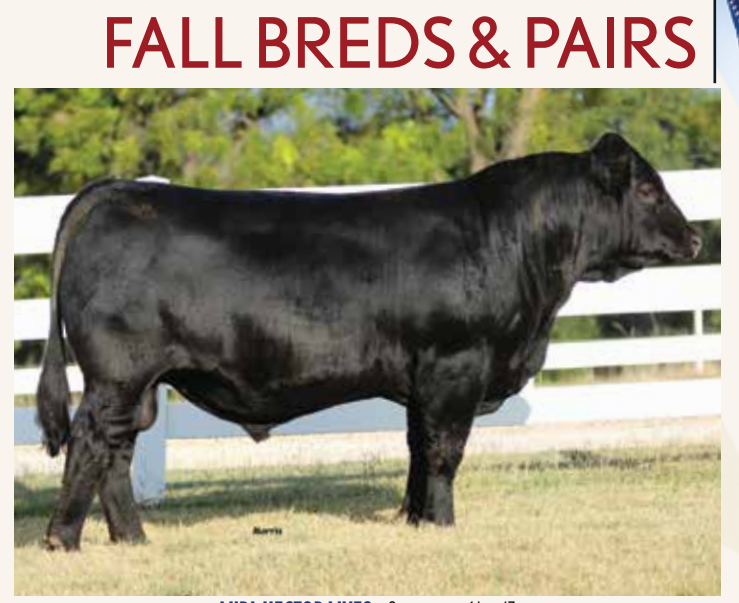
MIDL HECTOR LIVES • Service sire of Lot 47

Here is a homozygous polled, homozygous black, 3-year-old that is double bred to MAGS Yip. She is due 9/20/22 to MIDL Hector Lives, our homozygous polled, homozygous black son of TNGC Empire x LFL Zamora.