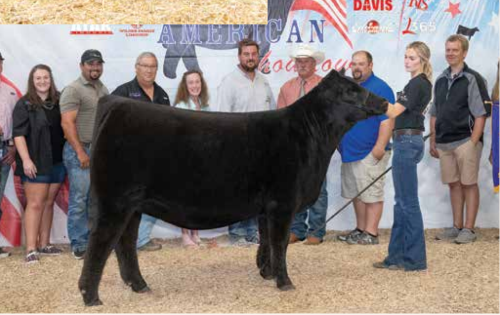
DL HUSH MONEY 502H • Paternal sister of Lot 64