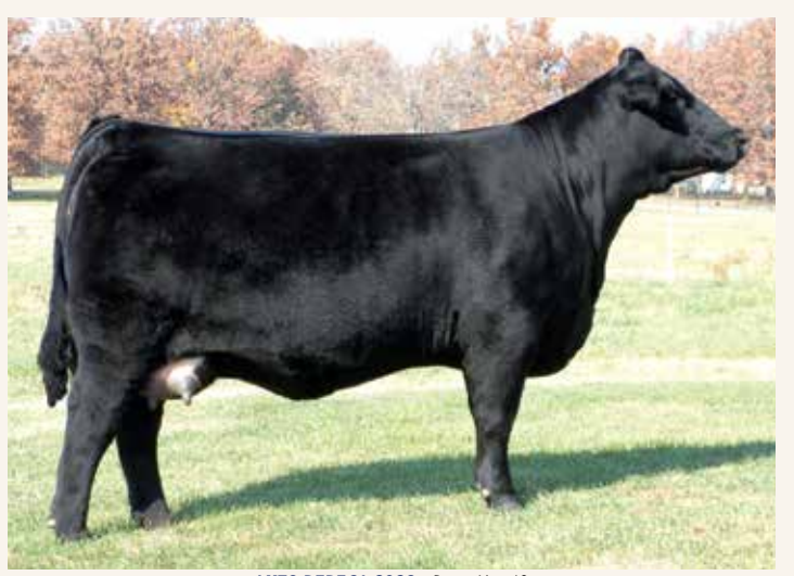
AUTO REBECA 292S • Dam of Lot 40

CLTM Beyonce is from of the most predictable pedigrees around. Honestly it doesn't get much better than this—AUTO Black Dakota x AUTO Rebeca. This homozygous polled purebred has a stunning profile and is ready to continue raising great progeny. High growth, high milk and big ribeye. She's carrying the service of MAGS Hershey Bar.