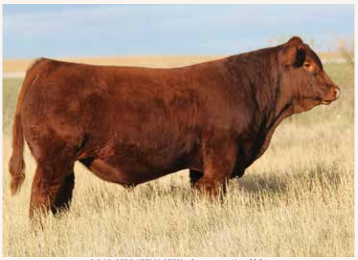
BBAR SERRATELLI 072H • Service sire of Lots 22-24

You won't have any problems making the right decision to take home J Bar J Great Clues G931G. This young female is double homozygous, 59% Lim-Flex and truly carries herself with grace and is loaded numerically. She is low birth weight with top ranking growth and carcass value. Her parents, Hemi x MAGS Zodiac daughter, brings you the predictability you demand. She should have an exciting calf come sale day from the rugged, powerhouse sire, B Bar Serratelli.