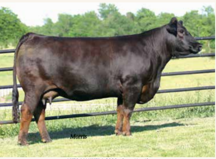
AUTO MANUELA 298S • Dam of Lot 48

You don't have to look too far in her pedigree to find the dynamic MAGS Manuela. This is one of those can't-miss pedigrees that will keep your hand in the air until the final gavel drops. Her sire, AUTO Real Deal, helped create the specimen that is AUTO Echo. This double homozygous purebred is broody in her design. Sells carrying the service of MAGS Husker.