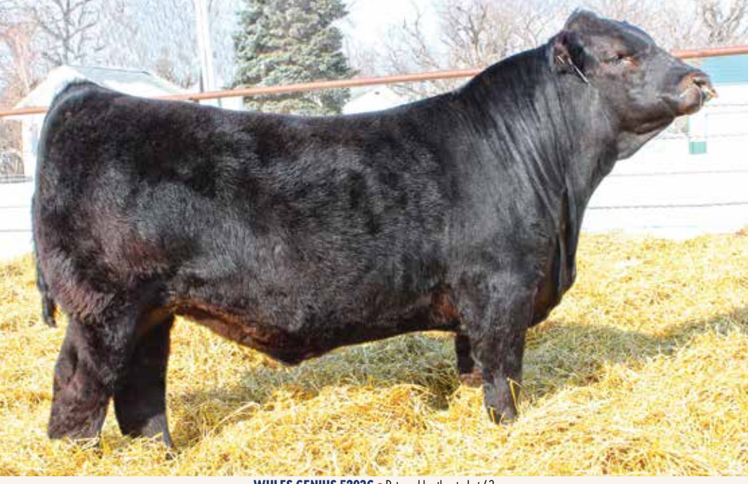
WULFS GENIUS 5293G • Paternal brother to Lot 63