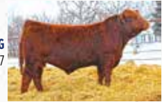
WULFS GARFIELD T937G Sire of Lot 37