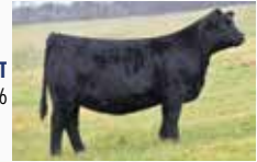
TMCK FOXTROT 569F ET Dam of Lot 36