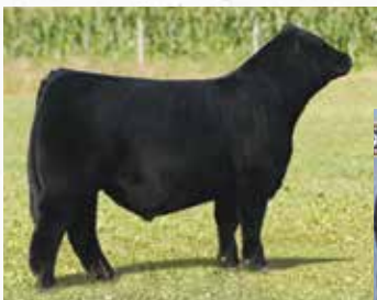
SSTO GUNS N ROSES 9408G ET Sire of Lot 34

Here is your opportunity to purchase exclusive semen on SL King Ranch. He is a son of SSTO Guns N Roses 9408G, a son of the famed Riverstone Charmed "Larissa" female. We feel there is a lot of matting versatility with the 84% homozygous polled, homozygous black bull.