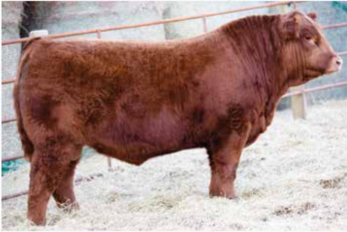
ANCHOR B GOLD RUSH 48G • Sire of Lot 32