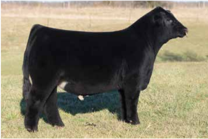
RATLIFF JUMP START 340J ET • Sire of Lot 28