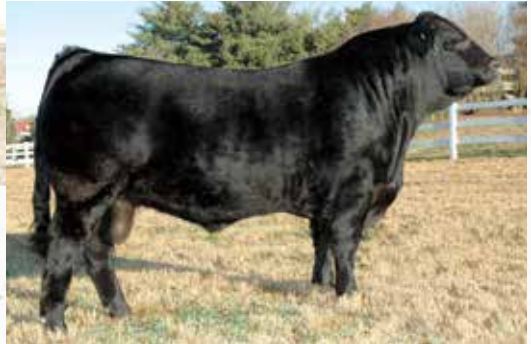
WULFS XCLUSIVE 2458X • Sire of Lot 20