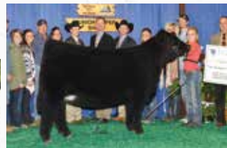
RIVERSTONE CHARMED Paternal grandam of Lot 28