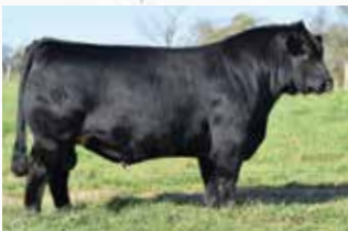
CJSL DAUNTLESS 6257D E Sire of Lot 21

MINO Kleopatra 002K is a double homozygous polled 53% Lim-Flex from the popular CJSL Dauntless 6257D who has done a great job siring striking females. Her dam is sired by ADLL 6691D, a son of EXAR Denver out of the great EF Yadda Yadda 809Y donor. This March heifer has the look for the show road and the genetics for the pasture. Sells open.