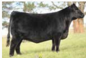
ELCX ELEVATE 684E Paternal grandsire of Lot 29