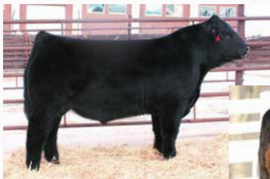
COLE ARCHITECT 08A • Sire of Lot 2

Here's a broody female who is sound in her structure and solid from the ground up. Her sire is the well-known COLE Architect 08A who transmits growth and performance. The dam's side is equally impressive tracing back to MAGS Xyloid. Bid with confidence.