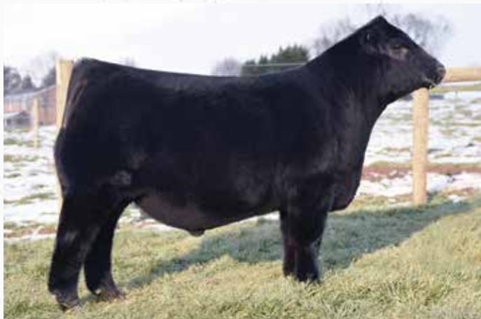
TASF HEINEKEN 405H ET • Sire of Lot 29