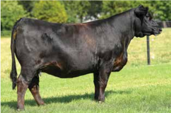
AUTO FOLLY 284F • Dam of Lots 30 & 31

AUTO Folly 284F is one of our lead donors and for good reason. She is the daughter of the proven MAGS Cable out of the famed AUTO Bliss 265Y. These embryos will be out of the new and exciting Wulfs Joint Venture G579J and TMCK Foxtrot 569F. Joint Venture is the Wulfs Fifty T804F son that recently took home Supreme honors at the Black Hills Stock Show.