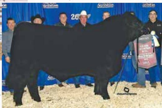
HIGHLAND BOSTON • Sire of Lot 9