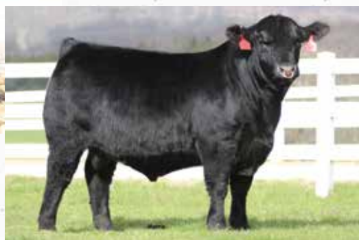
AHCC HEMI 0901E ET • Sire of Lots 44A & 44B