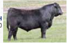
L7 HUMDINGER 0035H Sire of Lot 40