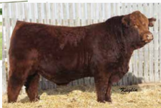
JYE EDMONTON 519E • Sire of Lot 7