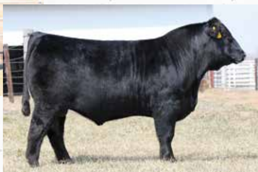
CELL ENVISION 7023E • Paternal grandsire of Lots 3A & 4A