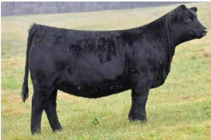
TMCK FOXTROT 569F • Dam of Lot 27

These embryos will be out of the new and exciting Wulfs Joint Venture G579J and TMCK Foxtrot 569F. Joint Venture is the Wulfs Fifty T804F son that recently took home Supreme honors at the Black Hills Stock Show. TMCK Foxtrot 569F is a lead donor in our program. She is a daughter of TMCK Cash Flow 247C out of TMCK Applause 301A. On paper, this donor is truly impressive, she ranks in the top 1% for weaning weight, yearling weight and total maternal.