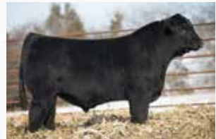
CELL HISTORY MAKER 0256H Sire of Lot 31