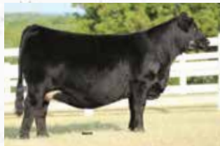
AUTO CALLIE 403D ET Maternal grandam of Lot 28