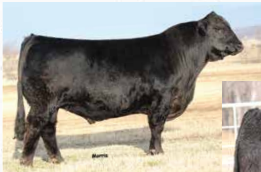
MAGS ZODIAC • Sire of Lot 5

Here is a MAGS Zodiac daughter out of a tremendous C L Burbank daughter. Several generations of greatness line both sides of her pedigree. She matches the way she is bred—a tremendous producer with lots of cow power. Get ready for what promises to be an exciting calf.