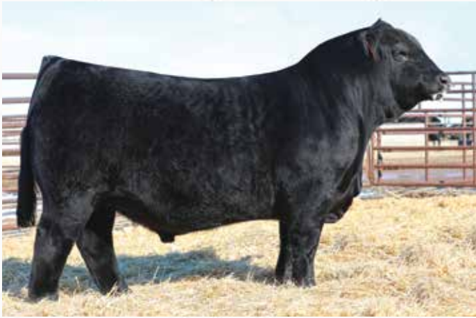
WULFS JOINT VENTURE G579J • Sire of Lot 27