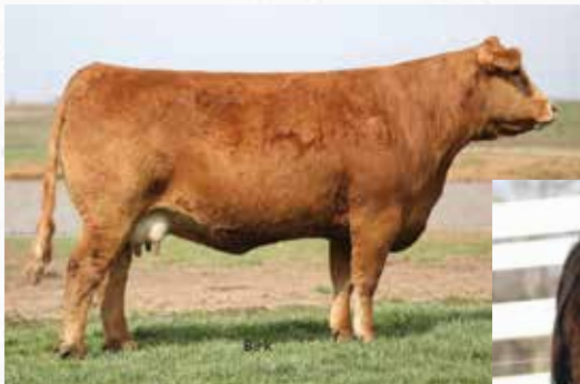
LIMOLYN XILDA • Dam of Lot 1

This Bieber Hard Drive Y120 daughter is stout featured with a balanced look. Her donor dam, Limolyn Xilda, is a purebred female we purchased from Canada and has since become a lead donor in our program. Study her lines, structural integrity, growth and carcass values and we think you'll agree, she's pretty darn good.