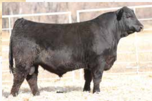
MAGS HODADDY 1648H ET • Sire of Lot 5A