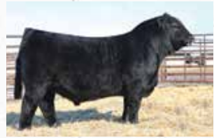
WULFS JOINT VENTURE G579J Sire of Lot 30