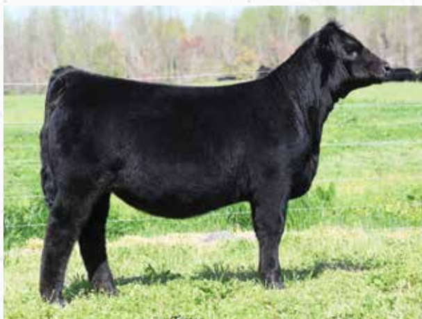
ELCX HIGHNESS 056H ET • Dam of Lot 29

ELCX Highness 056H is flawless in her design with a pedigree behind her that has proven to be a success multiple times over. Her dam, ELCX Elevate 684E, is a daughter of the breed legend, EF Xcessive Force out of DFLC HBHPC 1S, a daughter of JCL Lodestar 27L and the great DFLC HBHPC 25L donor. These embryos are sired by one of the hottest bulls in the breed, TASF Heineken 405H.