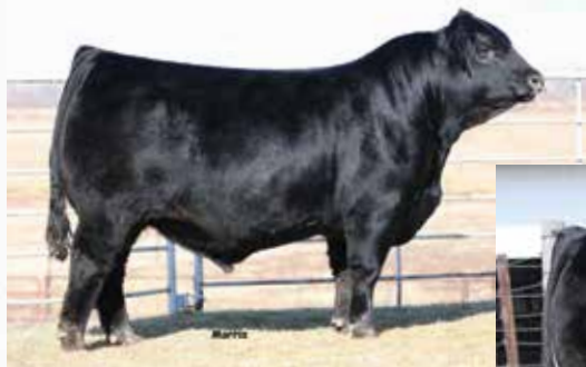
MAGS APPLE JACK • Sire of Lot 4

This is one of those can't-miss pedigrees that will keep your hand in the air until the final gavel drops. Her sire, MAGS Apple Jack, helped create the specimen that is CELL 8149F. This Lim-Flex is broody in her design.