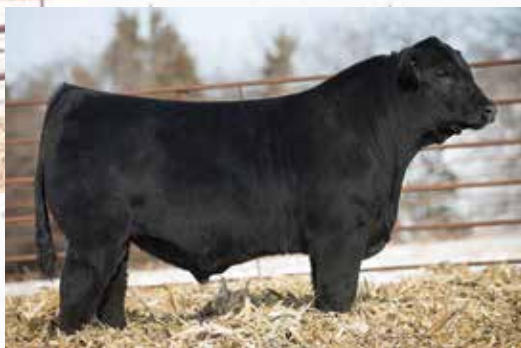
CELL HISTORY MAKER 0256H ET • Sire of Lots 3A & 4A