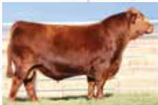
WULFS EMPRIZE 2424E Sire of Lot 38