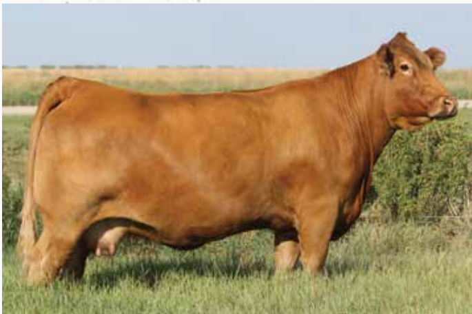
B BAR FOXTROT 21B • Maternal great grandam of Lot 32

An intriguing opportunity to flush Pinnacle's Honor Roll 72H. This female was a sale feature and top seller at Pinnacle View Limousin's 30th Anniversary Production Sale. She caught our eye because of her unrivaled amount of substance with genuine body shape and dimension and flawless structural build. She is the daughter of the popular B Bar/Hawkeye Sting 47F, who transmits muscle expression and center capacity.