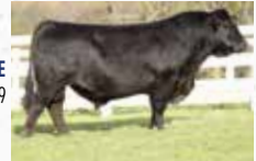
HBRL EQUALIZER 7510E Sire of Lots 18 & 19