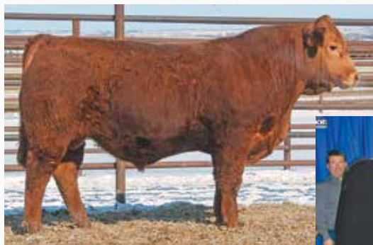
WULFS DEFEND K909D ET • Sire of Lot 8

LOT 8A: J Bar J Lancelot 334L, a 3/16/23 homo polled, red purebred son of Royal Jester RBGL 103J. BW: 84 lbs. Big-time purebred female! Her donor dam, Limolyn Xilda, is a purebred female we purchased from Canada and has since become a lead donor in our program. Wulfs Defend K909D was the top-selling lot from the 2016 Wulf Cattle Opportunity Sale. She comes with an exquisite red, homo polled, purebred Royal Jester RBGL 103J son.