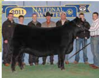
TASF WHISKEY LULLABY 357W Paternal great grandam of Lot 34