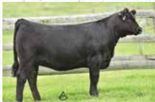
TMCK EDAMAME 421E Maternal grandam of Lot 21