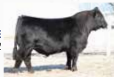
TNGC EMPIRE 736E Sire of Lot 22