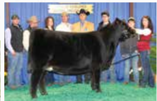
LLJB ABSOLUTE STYLE 3056A Paternal grandam of Lot 21