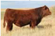
B-BAR SERRATELLI 72H Sire of Lot 42