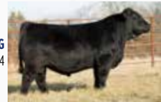
CELL GRANITE 9245G Sire of Lots 13 & 14