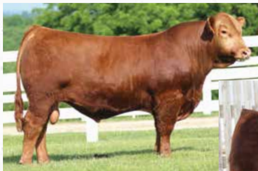
WULFS OZARK K115E ET • Sire of Lot 6

LOT 6A: J Bar J Let's Go 366L, a 4/3/23, double polled, red, purebred son of Royal Jester RBGL 103J. BW: 65 lbs. Looking for a red front pasture female, look no further than J Bar J Josephine 156J. She is a daughter of our proven Red Lim-Flex herd sire, Wulfs Ozark K115E, a son of the great Red Angus, Bieber Hard Drive. Her dam is a daughter of our Limolyn Xilda donor, a purebred female we purchased from Canada. This outstanding female comes with a son of Royal Jester RBGL 103J, which came easy at 65 lbs.