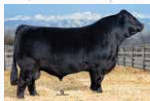
ELCX KINGS LANDING 599D ET Maternal grandsire of Lot 29