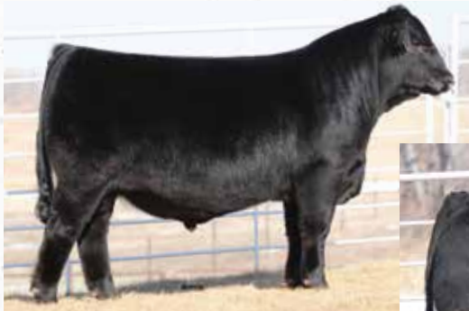
MAGS FIRESTONE 218F • Sire of Lots 45A & 45B

A son of the 2019 National Western Stock Show Champion Bull MAGS Firestone 218F. His dam is a highly productive MAGS Y-Axis daughter. Take note that he is homozygous polled. Turn him into your cow herd, you won't be disappointed!