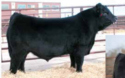
COLE ABSOLUTE 05A • Sire of Lot 3

You'll like the profile, structure, and power this COLE Absolute 05A daughter has to offer. This black, polled 56% Lim-Flex female ranks in the top 10% for weaning weight, top 3% for yearling weight, and top 10% for ribeye area. From top to bottom, this female is sound.