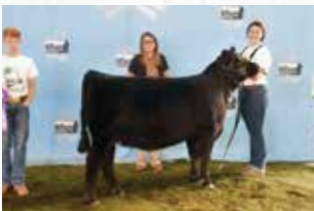
AUTO FLICKA 433F Dam of Lot 28

Ratliff Jump Start 340J is a FWLY Can Do son out of the famed Riverstone Charmed "Larissa" female whose influence is at a fever pitch. A full sister commanded a staggering $201,500 at auction for the Ratliff family, who went on to be named Supreme Champion Junior Female at the 2021 NAILE. AUTO Flicka is the product of the wildly successful CJSL Creed X AUTO Callie 403D mating. AUTO Callie 403D ET was selected Grand Champion Limousin Female at the 2018 All-American Limousin Futurity.