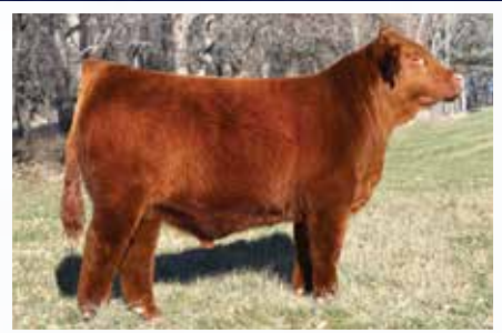
RBGL ROYAL JESTER 103J