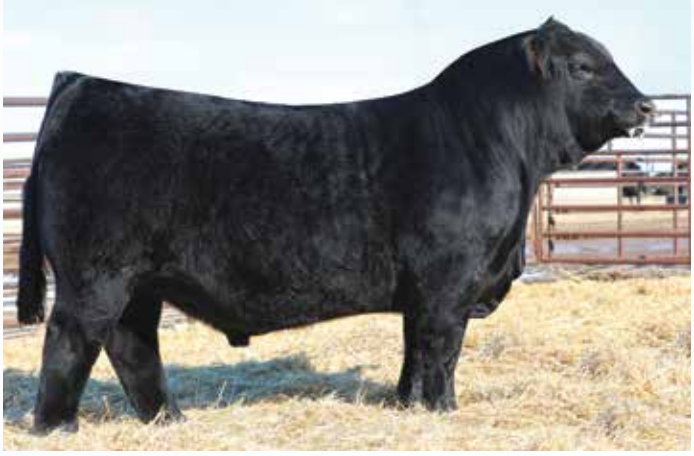
WULFS JOINT VENTURE G579J • Sire of Lot 28