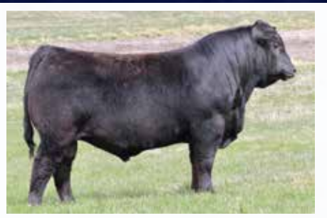
L7 HUMDINGER 0035H