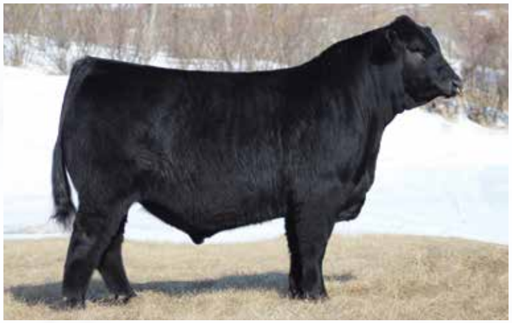
CWCL LUDENS FIRST DAKOTA 018F • Sire of Lot 26

Check out this fall, 75% Lim-Flex heifer! This daughter of CWCL Ludens First Dakota 018F has a lot of positives going her way. She has a powerful look to her with a super clean front end. She'll be competitive in the calf class and is geared to be a competitive senior yearling. Outside of the ring she has all the potential to be an impressive producer. Be the winning bidder sale day!