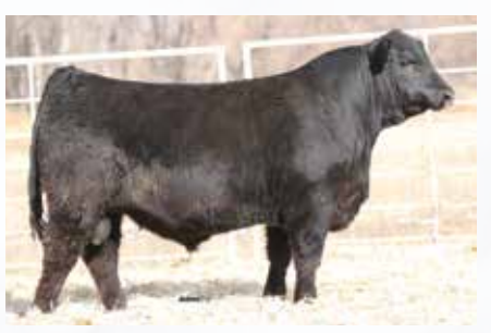
MAGS HODADDY 1648H