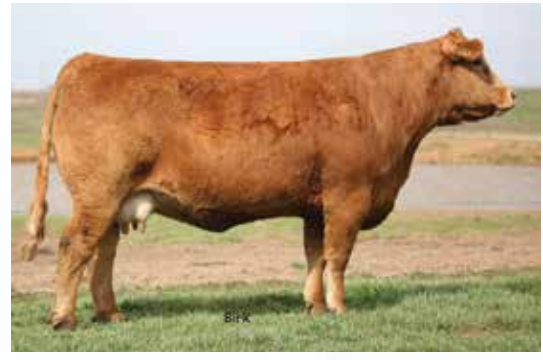
LIMOLYN XILDA • Maternal grandam of Lot 28

All the ingredients are here for this pregnancy to produce a top-notch, high-performing individual when she hits the ground! J Bar J Emerging Lady 789 is a daughter of Wulfs Claim K817C, a Wulfs Xcellsior son that was used heavily in our program. She is out of our well-known Limolyn Xilda donor female that has been a mainstay of our program for many years. This daughter has taken the place of her mother in our donor battery. Here she is mated to Wulfs Joint Venture G579J. He was recently shown and sold at the 2023 Black Hills Stock Show where he was purchased by Fillmore Limousin and later crowned Supreme Champion Bull. When displayed in Rapid City, many cattlemen admired him for his eye-catching phenotype. He combines athleticism, muscle expression, bone, length of body, power and mass; all while maintaining a masculine look. It is challenging to find purebred cattle as complete as this intriguing herd sire. It gets said too often, but this is truly an opportunity with very little risk yet great rewards.