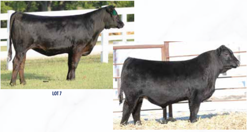
LVLS FULL DUTY 2201F • Sire of Lot 8

Take a look at this broody female. You'll like the profile, structure and power this L7 Humdinger 0035H daughter has to offer. This homozygous polled, 75% Lim-Flex female's dam is a nice-producing G A R Prophet daughter. From top to bottom, this female is sound. Also, take note of her top 10% ranking for Docility.