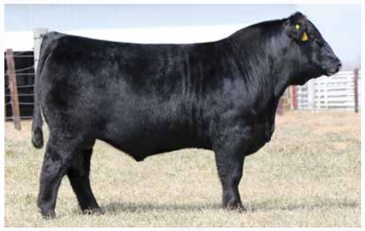
CELL ENVISION 7023E • Sire of Lot 24

A purebred ET female sired by performance giant Envision and out of AUTO Echo who traces back to the great Manuela cow. Echo is double homozygous. With a milk EPD of 21, Landra is a female worthy of serious consideration with breed-leading genetics and enhanced EPDs. Her birthweight to weaning weight to yearling weight spread is at the top of the breed. She had a birthweight of 70 lbs. This is a can't miss opportunity.