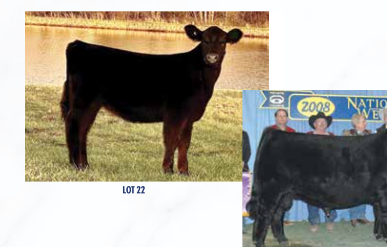
DHVO DEUCE 132R • Sire of Lot 23

KRLE Leilani 816L is a double homozygous, double black, WFL Hennessy 011H ET daughter out of the DL Gratitude 408G cow. This female's stunning phenotype is backed with balanced numbers across the board. She is elevated through her front one-third and gets out and goes freely. You can't go wrong here.