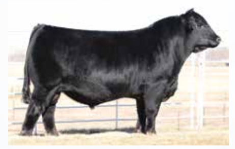
MAGS FIRESTONE 218F