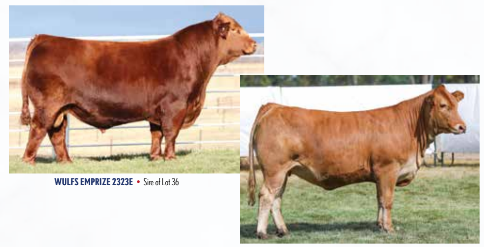
PINNACLE'S HONOR ROLL 72H • Dam of Lot 36