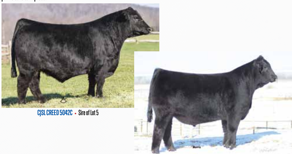
MAGS AVIATOR • Maternal great grandsire of Lot 8

CJSL Creed 5042C daughters like this one don't come along often. This 54% Lim-Flex female blends structural correctness with broody, cow-making power. Her dam is a well-producing DALT Absolute Anarchy daughter, bringing an impressive maternal influence that adds growth and fertility. AUPH Greedy Gal 51G ranks in the top 10% for marbling and top 25% for yearling weight and is known for transmitting a stout build and eye appeal—this pair is sure to impress.