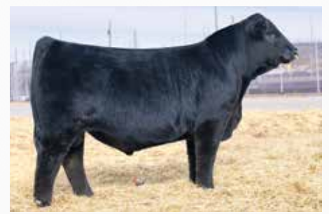
AHCC LANDSHARK - Sire of Lot 18E