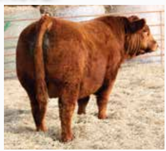
ANCHOR B GOLD RUSH • Sire of Lot 18B