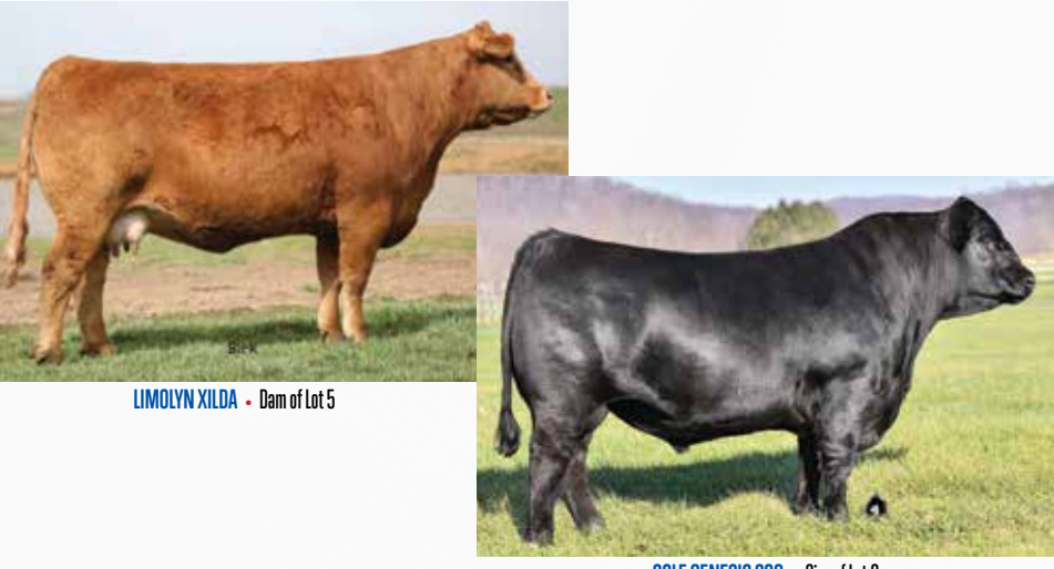
COLE GENESIS 86G • Sire of Lot 6

J Bar J Hula Hoop 068H brings a fresh genetic twist and a whole lot of versatility. This 50% Lim-Flex female is smooth made, angular through her front end and balanced on the move. Her dam stacks cow power and longevity, and her March-born bull calf by Wulfs Latigo K750L is already showing growth, style and structural integrity. With a different pedigree, this pair gives you flexibility in your future mating decisions and the confidence of a performance-based foundation.