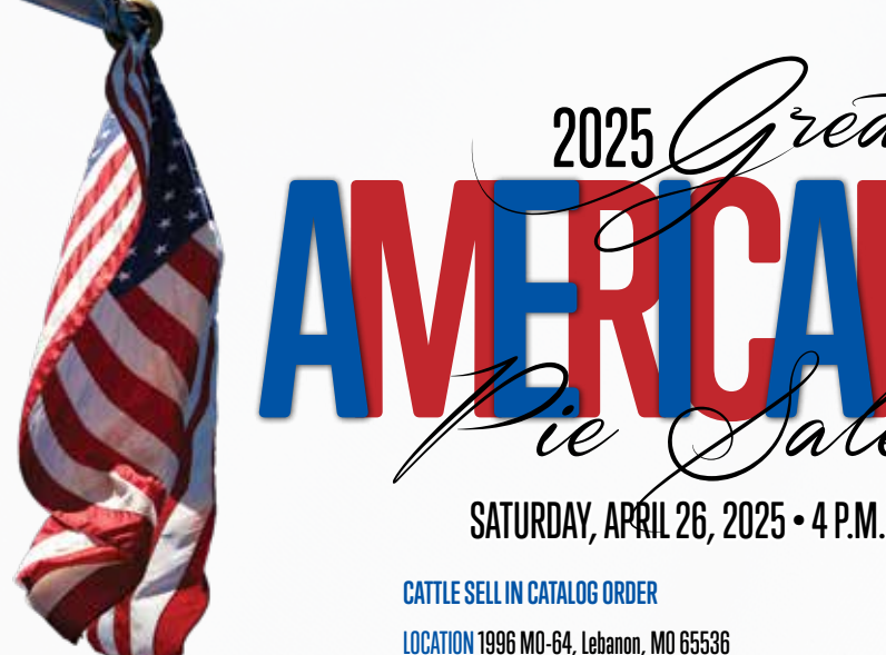
MLBA Dinner, Banquet and Benefit Auction immediately following sale.