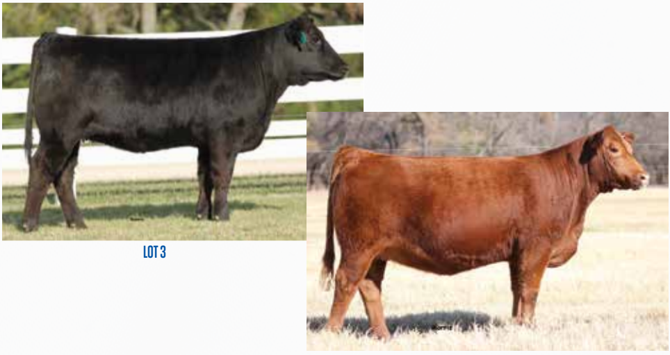
SSTO DARLA 603D ET - Dam of Lot 4