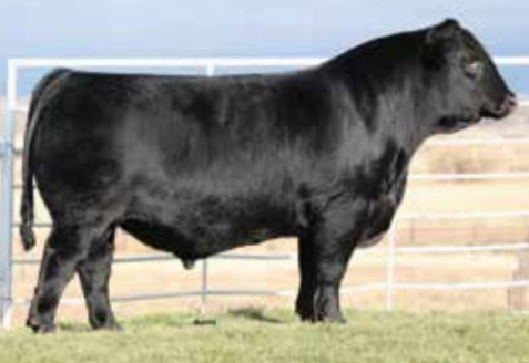
AHCC EARNING POWER 900E ET - Service sire of Lot 13