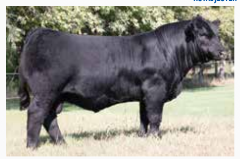
WULFS KA-CHING • Sire of Lot 18D