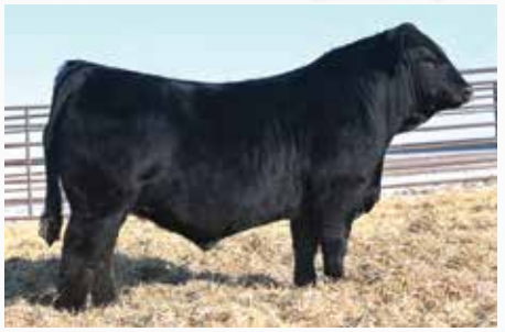
WULFS MORRIS 9467M - Sire of Lot 18A