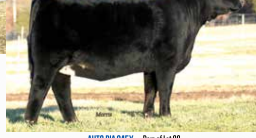
AUTO PIA 245X - Dam of Lot 20