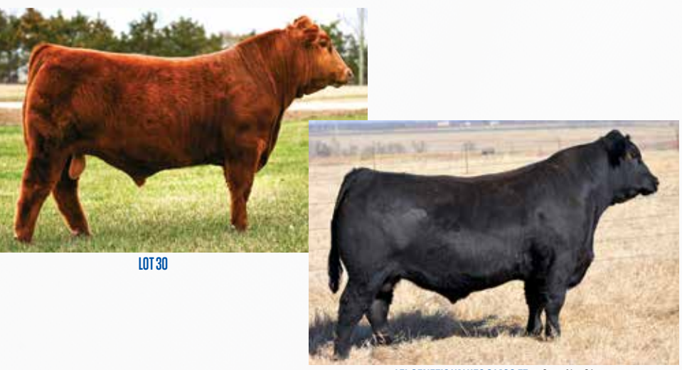
LFL GENETIC VALUES 9148G ET - Sire of Lot 31

ODCC Moonshine will be a crowd favorite sale day. He is a long sided, easy fleshing, big bodied, level topped, docile bull that will add pounds to his calf crop. He is sired by the heavily used FWLY Purple Haze, who stamps his progeny with an attractive phenotype and structural correctness. His dam, AUTO Chesapeak 441C ET, is a beautifully patterned S A V Brilliance 8077 daughter. Don't miss this red, 65% Lim Flex.