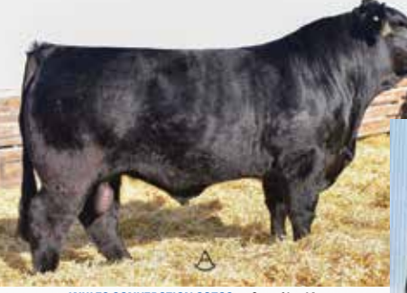
WULFS CONVERSTION 3970C . Sire of Lot 14

This 83%, double homozygous bred heifer brings consistency and performance. Her sire, Wulfs Conversion 3970C, is known for calving ease and structure, while her dam, a GV X-Man daughter, is as consistent as they come. She boasts elite carcass EPDs, and a top 10% rank for $TPI. She is bred to Little's Galena 256G, an impressive sire that transmits muscle and impeccable structure. A future donor in the making.